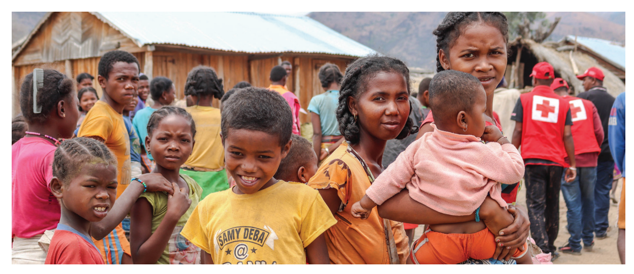
Community in Ambatoabo, Madagascar, 2021.