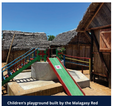
Children's playground built by the Malagasy Red Cross in the village of Mananjary, Madagascar, 2023.

a sandbox— based on suggestions from a small group of children and caregivers consulted informally at the project's onset—the space now offers children a place to unwind and enjoy outdoor activities during breaks between classes.