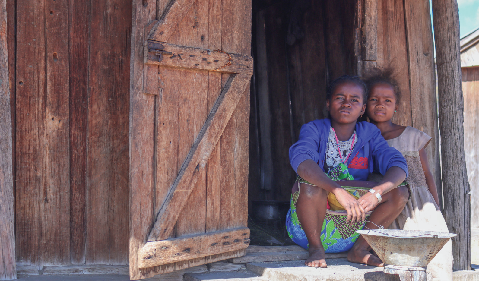
Houses in the Commune of Ambatoabo, Madagascar, 2022.